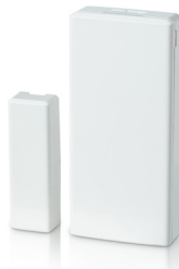
3 - Door/Window Sensors