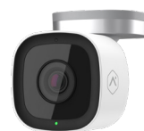
Outdoor 1080p WiFi Camera