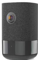
180-Degree HD Camera with Zoom and 2-Way

Includes two of the following cameras for $199.95*