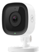
Indoor 1080p WiFi Camera