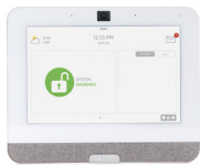
1 - IQ Interactive Panel

Includes the following equipment for $149.95*