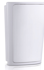
1 - Motion Sensor (85 pounds)